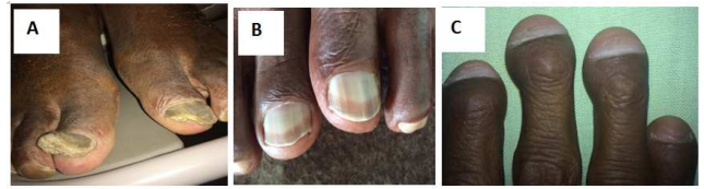
Figure 4. (A) onychomycosis. (B) Lindsay's nail ou half and half nails. (C) brachyonychie.

No cases of late cutaneous pseudoporphyria, neither cutaneous calcification nor cutaneous amyloidosis were observed in this series.