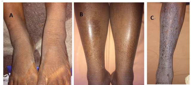
Figure 1. Mild (A), (B) moderate, (C) severe xerosis of the leg with ichthyosiform appearance.

Cutaneous xerosis was present in 72.86% of patients. It was frequently localized on the lower limbs in 82.9% of patients, and diffuse in 17.02% of cases. In 2 cases, the xerosis of the legs was severe giving an ichthyosiform appearance (Figure 1).