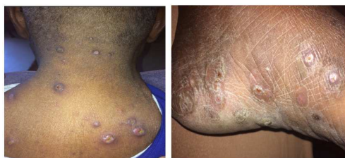
Figure 3. Kyrle's disease on the back and foot with a papulo-nodule centred by a yellowish horny plug.

Skin infections were observed in 14 patients. Mycotic infections were present in 9 cases, including 4 cases of seborrheic dermatitis, 3 cases of dermatophytosis and 3 cases of pityriasis versicolor. There were 3 cases of bacterial infections observed including folliculitis, pyoderma and furuncle lesions.